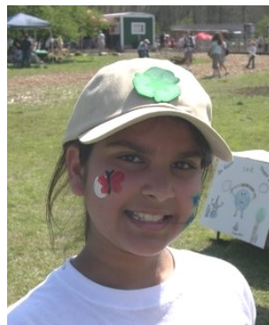
Young participant has her face painted at Earth Day celebration.